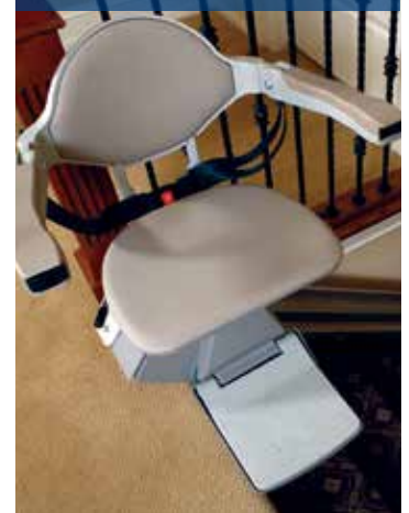
Padded, generous seat