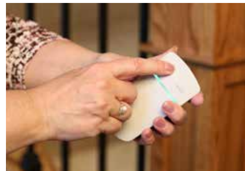
Two wireless call/sends allow remote control access.