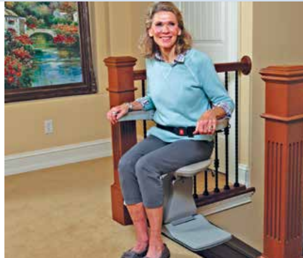
Offset swivel seat makes getting on/off easy.