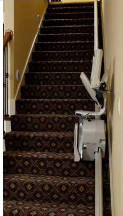
Compact, flip-up design for plenty of open space on stairway.

“Green Bay Packers Hall of Fame Quarterback”