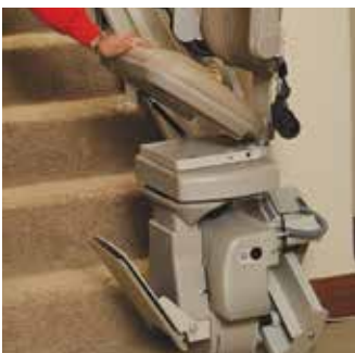
Power folding footrest automatically flips up/down when seat is raised/ lowered.