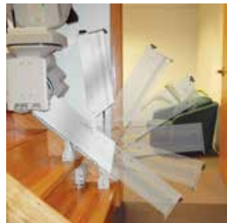
Power or manual folding rails for narrow hallway or when doorway is at the bottom of stairs. Manual operation or push button automatic.