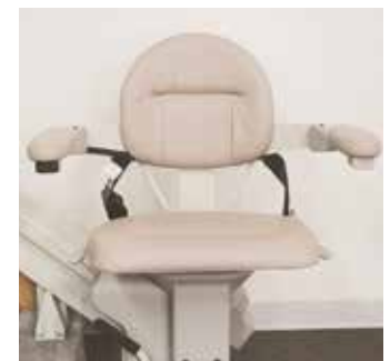
Larger seat and footrest for increased comfort.