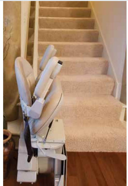
Close installation to wall.

“Green Bay Packers Hall of Fame Quarterback”